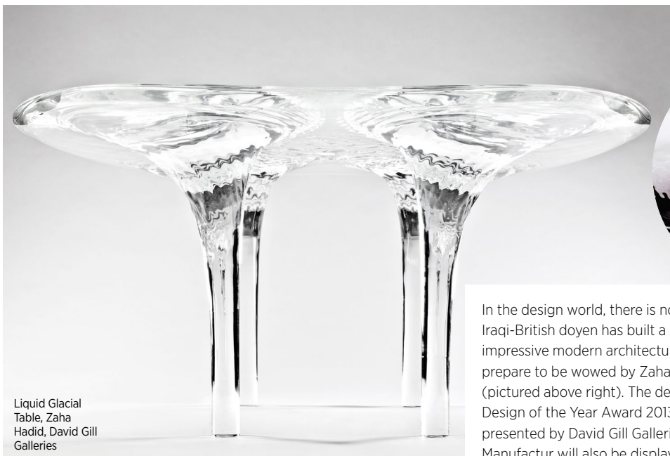
Liquid Glacial Table, Zaha Hadid, David Gill Galleries